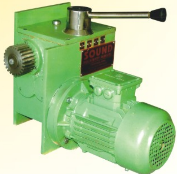
Cross Feed Drive Gear Box