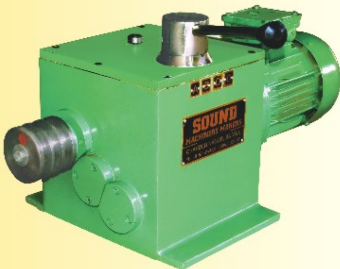
Lifting Feed Drive Gear Box