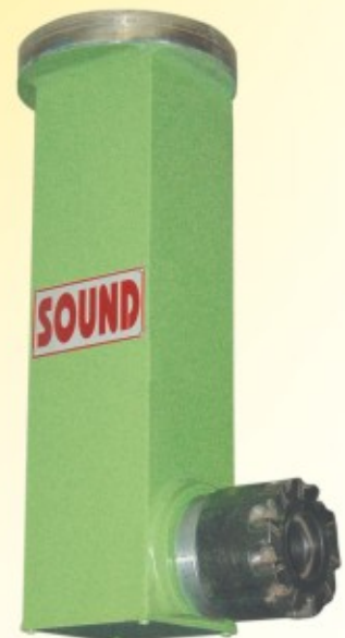
Extra Long Universal for Depth Machining