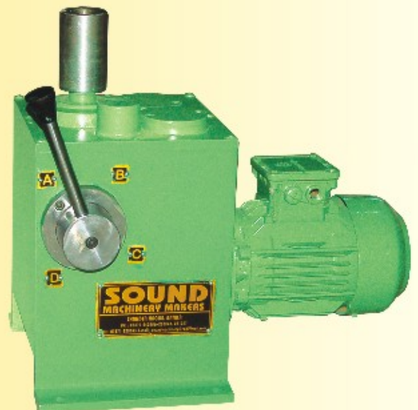
Lifting Feed Drive Gear Box for Side Milling Head