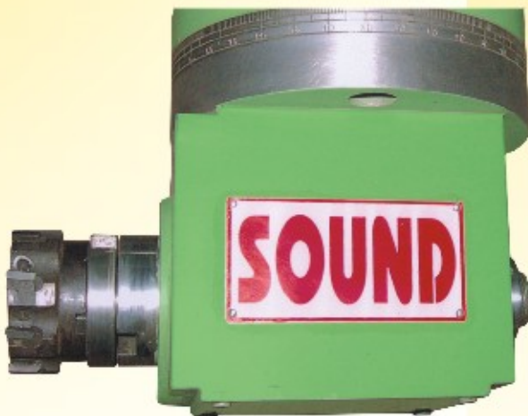
Standard Universal for Side Machining